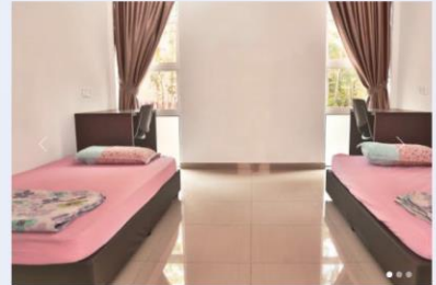
KMR 2 STUDIO

2 Beds, Study Desk, Closet, Shared Bathroom