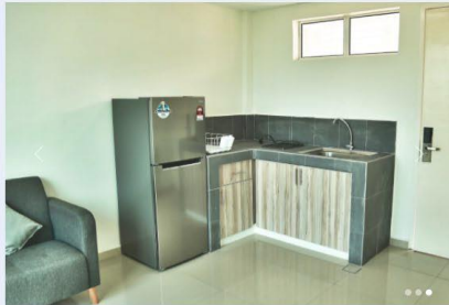
KMR 2 APARTMENT TYPE 1

1 Room, 1 Bathroom, Bed, Sofa, Closet, Dining Table, Refrigerator, Study Desk & Air Cond, Water Heater and Induction Cooker