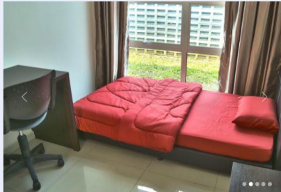
KMR 2 APARTMENT TYPE 2

2 Room, 1 Bathroom, Bed, Sofa, Closet, Dining Table, Refrigerator, Study Desk & Air Cond, Water Heater and Induction Cooker