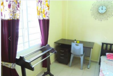
KMR 1 APARTMENT TYPE 2

2 Room, 1 Bathroom, Bed, Sofa, Closet, Dining Table, Refrigerator, Study Desk & Air Cond