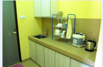
KMR 1 APARTMENT TYPE 1

1 Room, 1 Bathroom, Bed, Sofa, Closet, Dining Table, Refrigerator, Study Desk & Air Cond