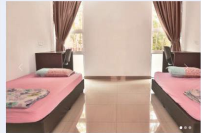
KMR 2 STUDIO

2 Beds, Study Desk, Closet, Shared Bathroom